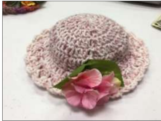
Volunteer SUE HOELSCHER crocheted for months to create the tiny hats for individual gifts and centerpieces.