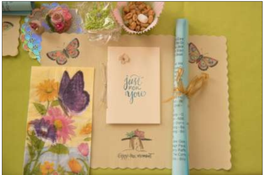
The focus was on fellowship, fashion and food!